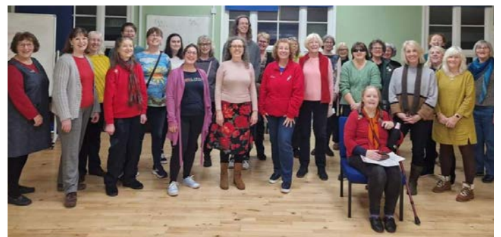
The last visit - Norwich Harmony