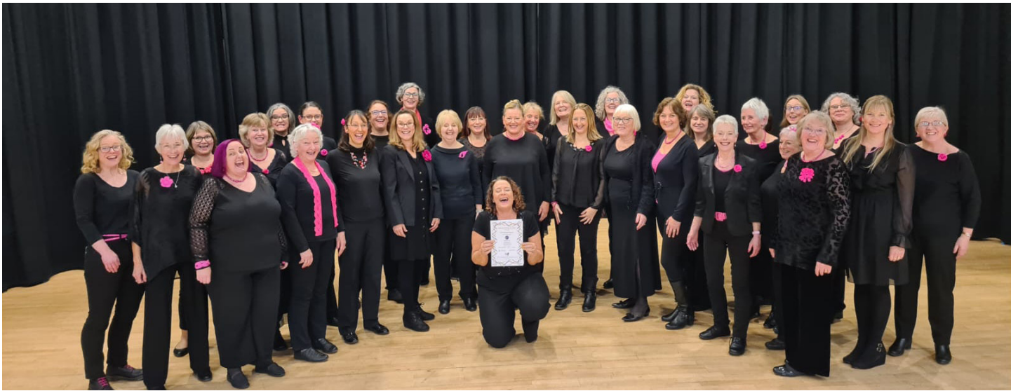
Fascinating Rhythm at Nailsea Festival of Music