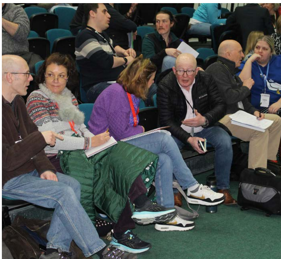
As well as learning from faculty, delegates were encouraged to share their experiences and gain insights from each other.