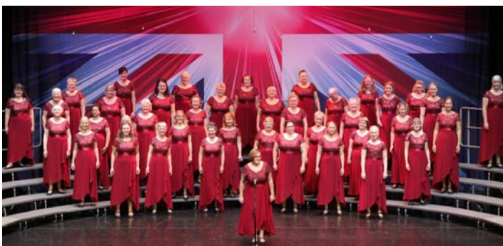
Harmony InSpires at Convention