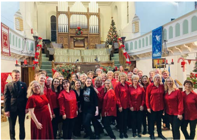
Bristol Fashion, Sonic, Chance Encounters, Specs Appeal, In The Wings, and Red Velvet