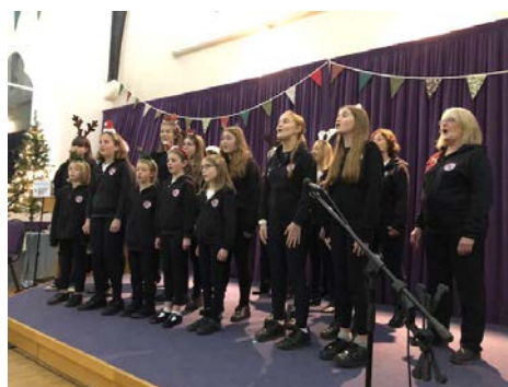
Junior FR at The Big Sing

witnessed an impressive £887.30 in direct donations, with an additional £105.33 expected through Gift Aid, bringing the total funds raised to a remarkable £992.63.