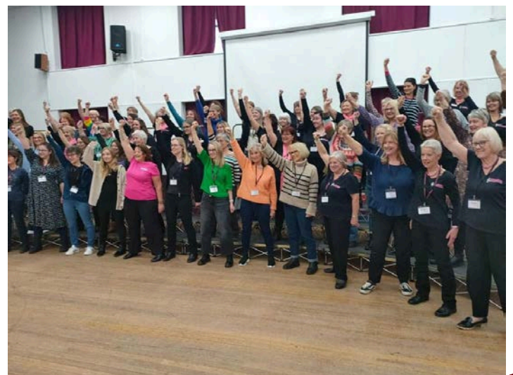
Love to Sing