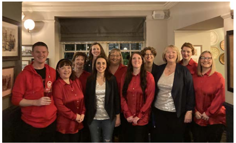
MicroFashion with Sonic at The Folly Pub