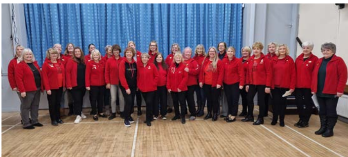
The first visit - Red Rock Harmony