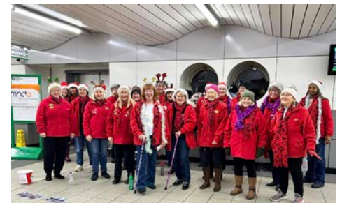
The Milton Keynes Station Christmas performance

One of our many Christmas performances was once again on the concourse of Milton Keynes Railway Station. This is always a favourite of ours and the commuters and travellers are so lovely, not to mention generous with their donations. We managed to collect a total of £230 cash in an hour for our charity, MND. This is such an achievement nowadays when a lot of people do not carry cash. We loved singing all the