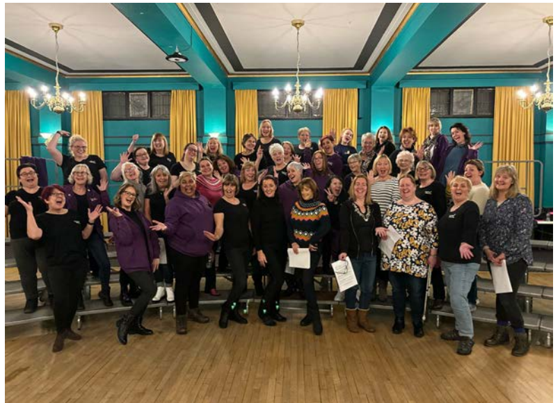
Our first open evening on 18th January with our potential new members