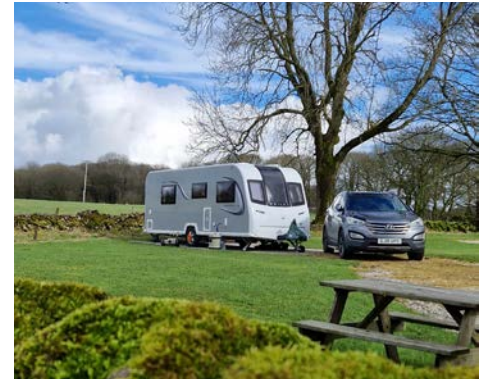
The Grand Tour caravan

I was delighted to attend Convention in Harrogate. There was no way I was going to miss it although our route had to take a bit of a diversion, much to my husband's amusement. Sitting in the audience I could see and hear the result of all the hard work of the choruses I had visited, as they performed their polished set pieces - WOW!