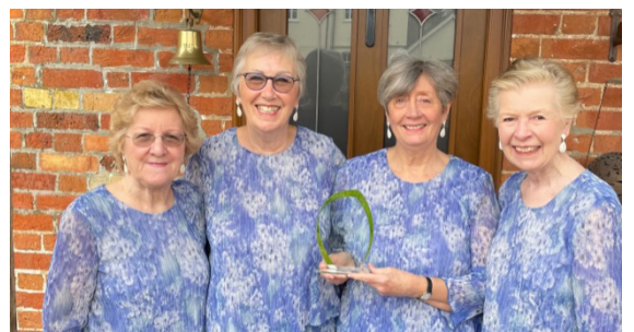
Perception with their Senior Quartet Trophy