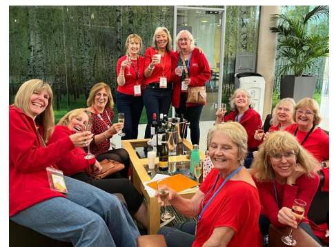
Velvet Harmony at Harmony College