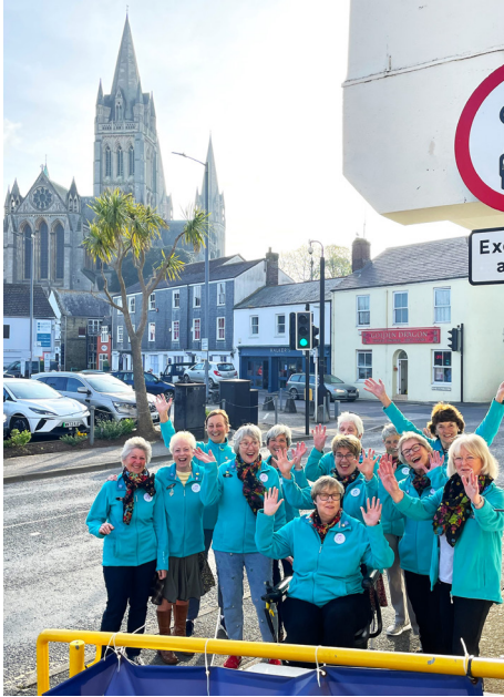
Our new rehearsal space is overlooked by the very beautiful Truro Cathedral

We've been based in the small Cornish village of Perranwell for some time, but earlier this year we decided to look for a new venue. Amongst other things, we wanted somewhere closer to one of the bigger towns to give us a larger area to recruit from. And so, the hunt began in earnest.