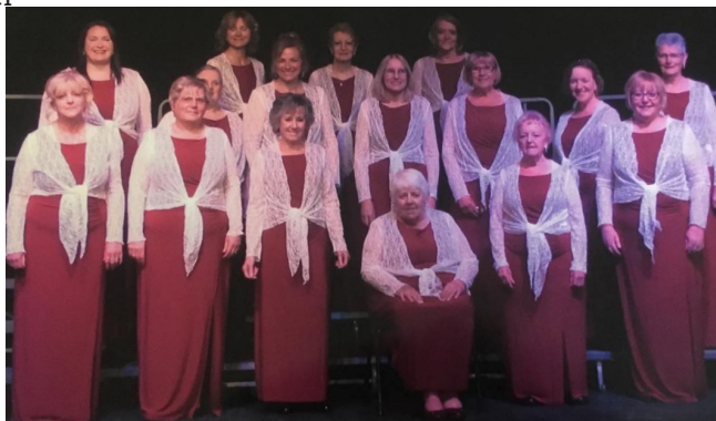
Vectis A Cappella