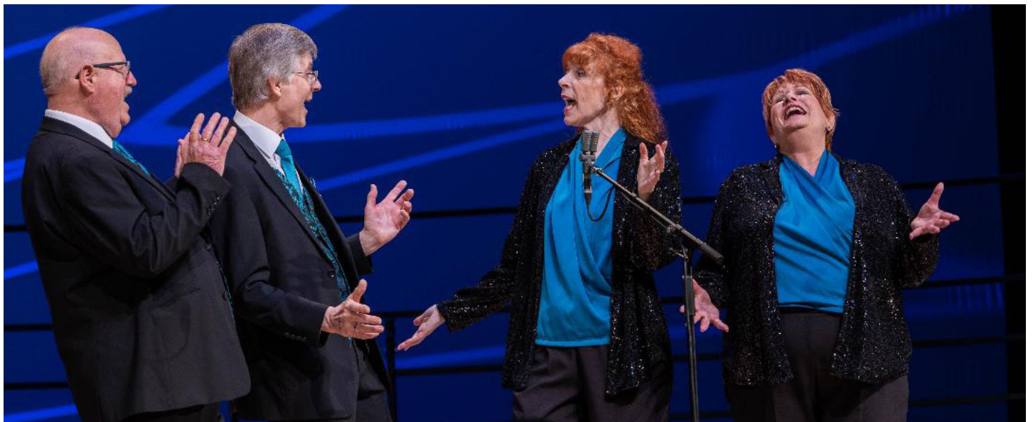
Crown Derby performing at the BHS Midwinter Convention