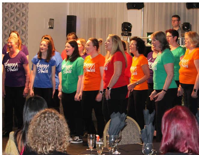
GraceNotes at ELEVATE

lifestyles, and raises awareness about mental health. Their ELEVATE event is a very popular fundraiser which features local performers like GraceNotes.