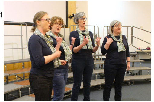
Gotta get with my friends!

All this culminated in an amazing showcase experience. We knew our contest songs weren't ready to share just yet, so we picked something completely different to sing to Harmony College delegates: a madrigal we'd sung out a few times and thought the LABBS audience would enjoy. Oh