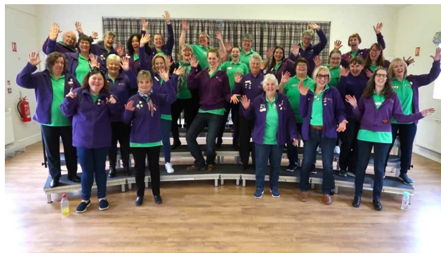
Abbey Belles Chorus

One of our Belles wrote 'Murderous'. WHAT? All was explained when we learned that her husband had just trapped her hand in the car seat!