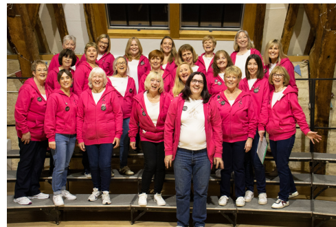
Cleeve Harmony Chorus

Cleeve Harmony is 10 years old! Cleeve Harmony is 10 years old! Old? No way! Cleeve Harmony is 10 years bold Bold, fabulous - and resilient, the truth be told! We're all about that bass and forget about the price tag, yeah But heart of my heart and beyond the sea is also where we can be We breathe, we hum, we sing into a cup, we bubble And the choreo gives some of us a bit of trouble