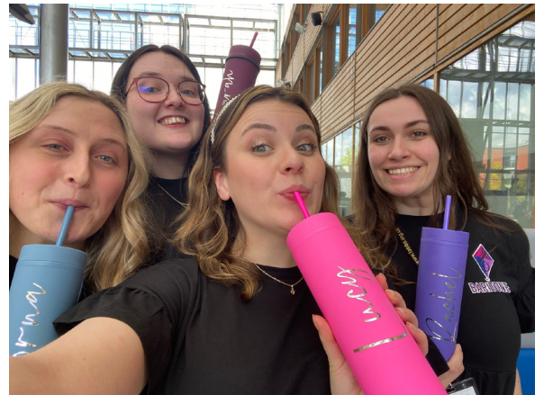
Chance Encounters at Harmony College