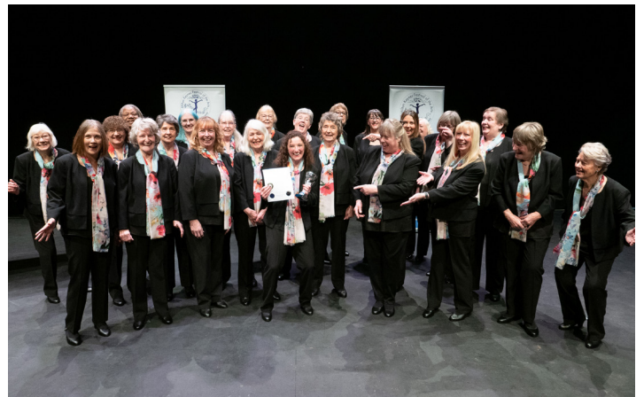
Winners! Junction 14 at Milton Keynes Festival of the Arts