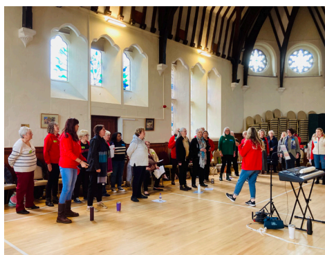
Lamorna leading a warm up