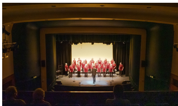
Main Street Sound at York Community Choir Festival

2022, Three Crown Sound from Hull were there too, but due to the number of choirs wanting to take part we had to narrow our catchment area this year!