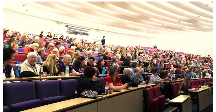
Harmony College delegates, raring to go!

We knew it was going to be a cracker when we reached maximum capacity of on-site accommodation, and it didn't disappoint. Over 300 LABBS members and non-members gathered for a weekend of music, singing, learning, laughter, and friendship. They left with memories of a great time and their barbershop batteries fully recharged, having taken part in one of many streams on offer, from singing in one of two choruses, quartet coaching, director education, personal development, or the new Extreme Quartet stream.