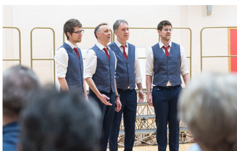
Off The Record

sharing a concert with Gloucestershire mixed group Go Vocal and barbershop quartet Off The Record , on 18th February at Mangotsfield School.