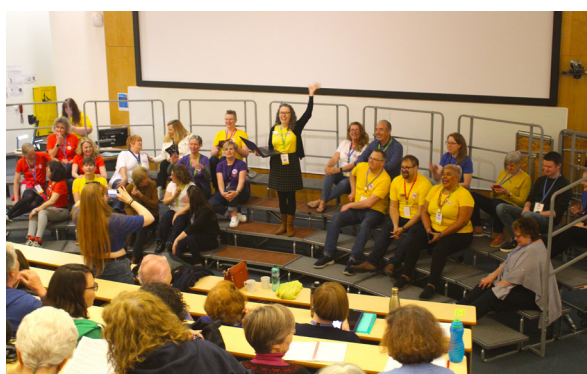
Harmony College Faculty

'Really informative weekend, and everyone – faculty and participants – have been so supportive. It's been so good catching up with people too. And wow – such a great atmosphere!'