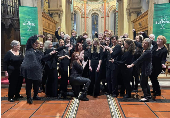
The Red Rosettes at St George's church