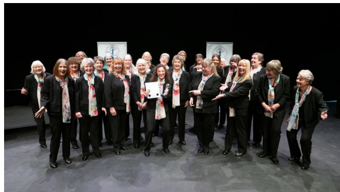
Junction 14: Fun, Enjoyment, Achievement

For more information, please see the advert on our website, www.junction14.org , or get in touch at music.team@junction14.org