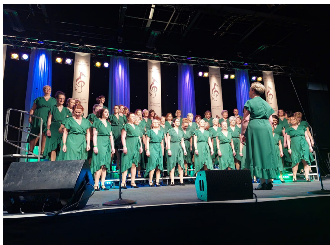
Cheshire Chord Company at the North Wales Festival

The rest of 2023 is looking pretty busy for Cheshire Chord Company, so make sure you keep up to date with everything Cheshire Chord by following our social media pages @CheshireChord .