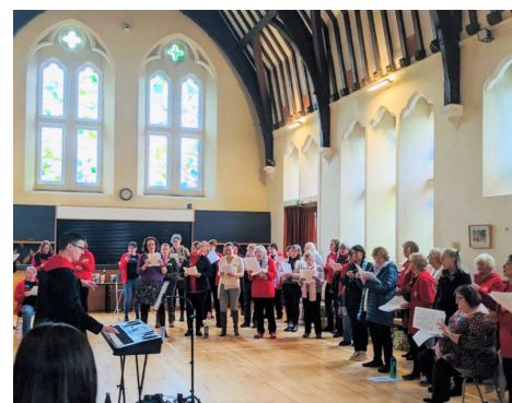
Tenor - Bari duets