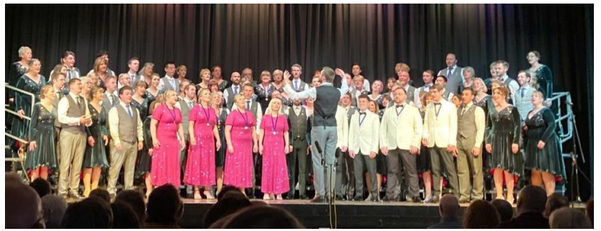
The Road to International finale

While a small group collected the risers from our rehearsal hall, the rest of the choruses and quartets converged on Pudsey Civic Hall, ready for final rehearsals. With rehearsals complete, excitement to share the stage with such talent grew, and before we knew it we were donning dresses, applying makeup and finalising our vocal preparation. We were ready for Showtime.