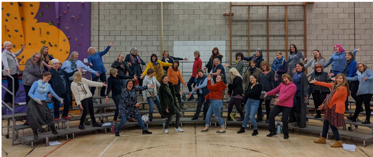
Just when we were excited to get back on the risers...