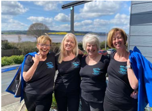
River City's scratch quartet, formed for National Barbershop Quartet Day

Well, where do we start? After our marvellous crazy Christmas party (you had to be there!), we certainly started the year with a mighty big bang.