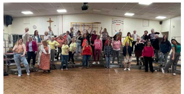
Joyful Rosettes celebrating being back on the risers