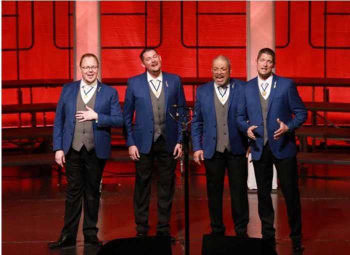
Forefront - Headline Guests