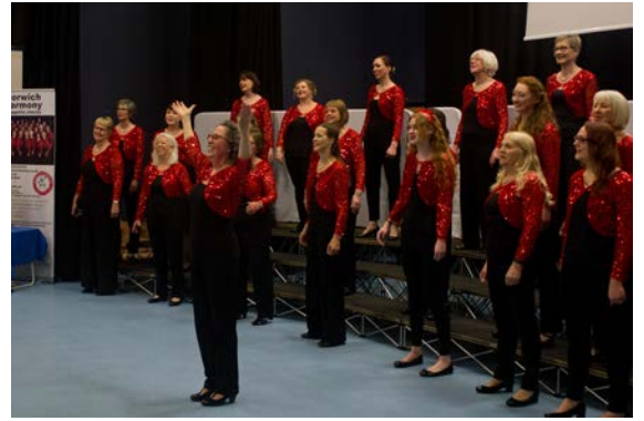
Norwich Harmony sparkling in our first performance of the year