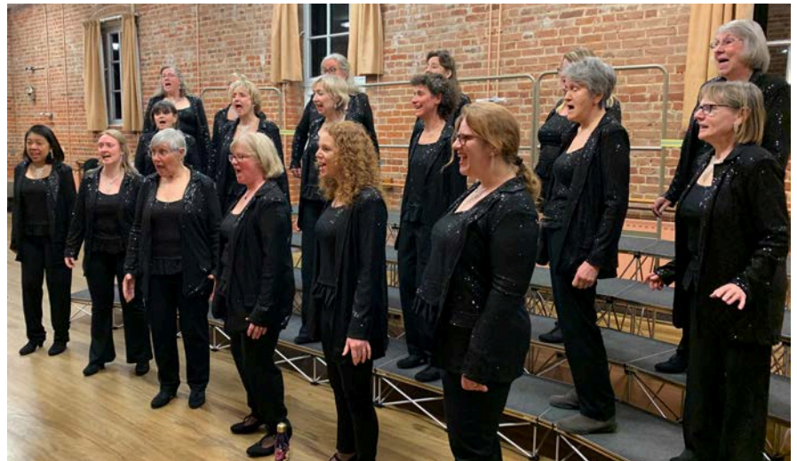
Welwyn Harmony dress rehearsal

In April we ran a three-week 'Come and Sing' taster course and recruited some great new singers. Such a delight to be live again, and able to share the joy of a cappella singing, instead of a Zoom course like last year. And now we are settling into a summer of singing at outdoor village, town and garden events, indoor events and our first big concert for two years – and preparing for Convention, of course! Exciting times!