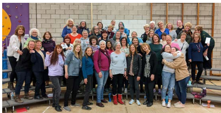
Finally back on the risers!