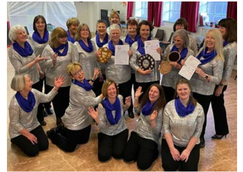
River City, celebrating their success at Exeter Performing Arts Festival