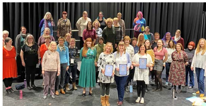
The Theatre at Woodhouse Grove School, Leeds