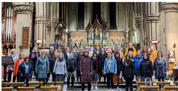
Gorgeous overtones at All Saints Church, Leeds