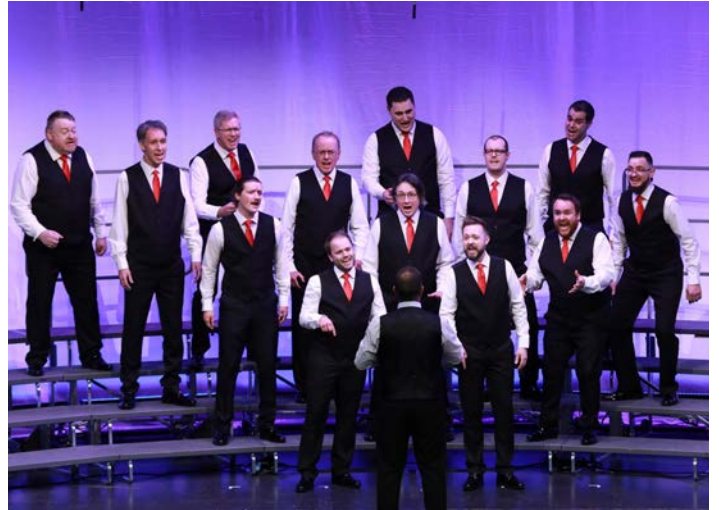
Malevox - BABS Small Chorus Award Winners and Bronze Medallists