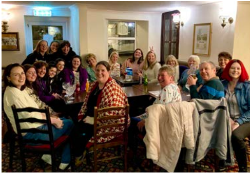
Post-show drinks, toasting our very talented GraceNotes

While the last couple of years have been challenging, we do feel incredibly lucky to have grown and been able to welcome so many new people to our wonderful chorus, some of whom are joining us as preparations for Convention are well underway. We're busy rehearsing songs, modelling new dresses, and filling our calendar with singouts to hone our performance skills. With all that going on, it would be easy to overlook how