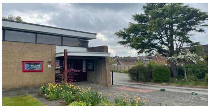
Adjusting to rehearsing at Wigton United Reformed Church, Leeds