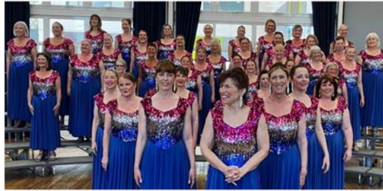
Amersham A Cappella's all-day rehearsal