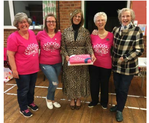
AAC Long Service Awards