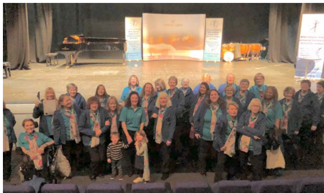
MK Arts Festival winners 2022