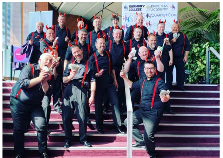
The Royal Harmonics - LABBS Entertainment Award Winners