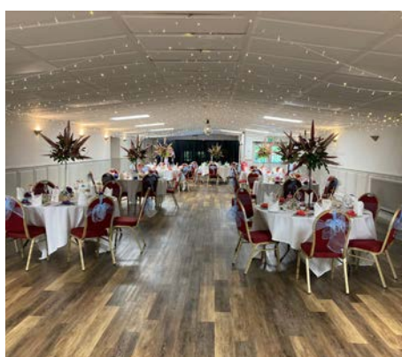
Annual Dinner table settings

Eileen Askew, PRO The Belles of Three Spires