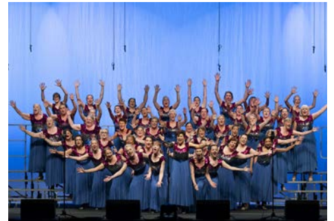
Amersham A Cappella