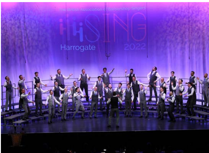
Meantime - BABS Male Chorus Contest Champions