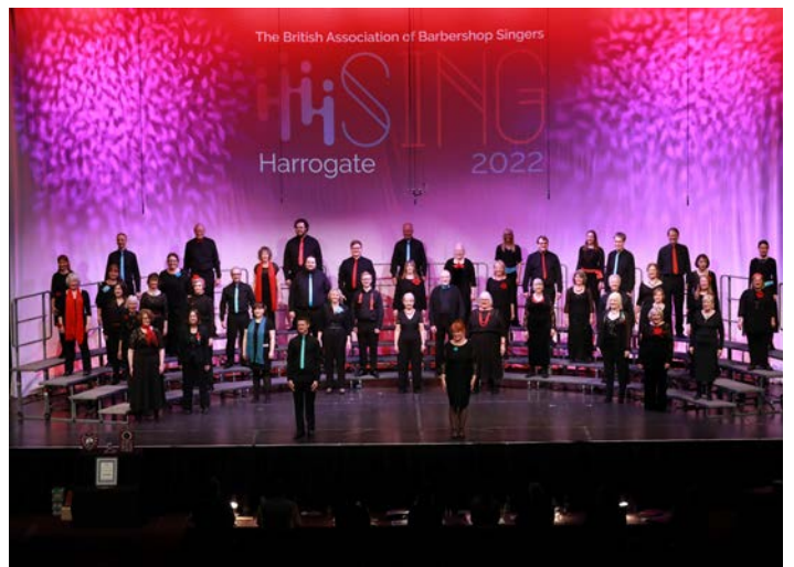
The Bristol Mix - BABS Mixed Chorus Contest Champions