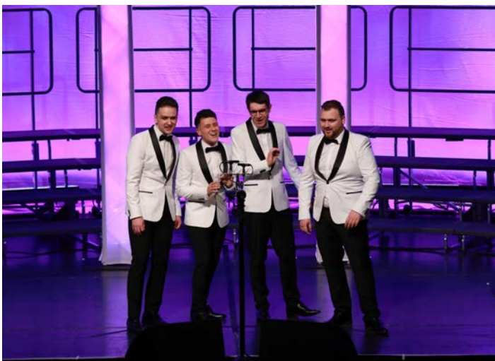
Limelight - BABS National Quartet Champions